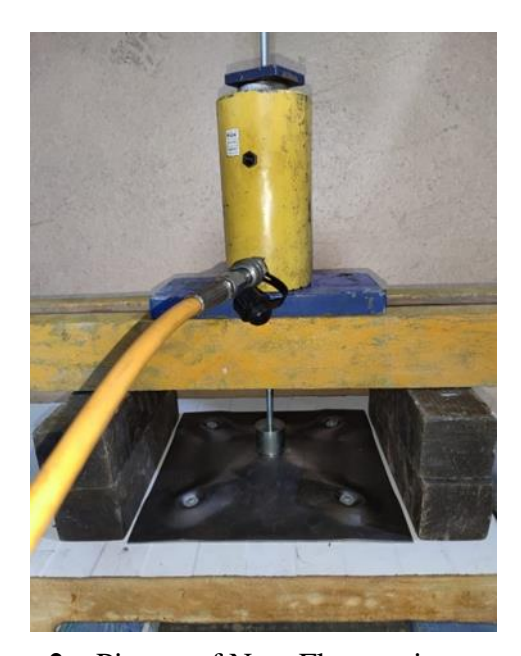
Figure 2a. Picture of NovaFlat specimen tensile test setup (System 1)