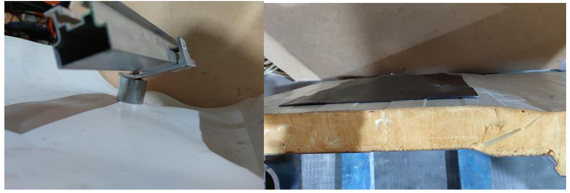
Figure 3b. Picture of NovaFlat specimen failure mode (System 2)