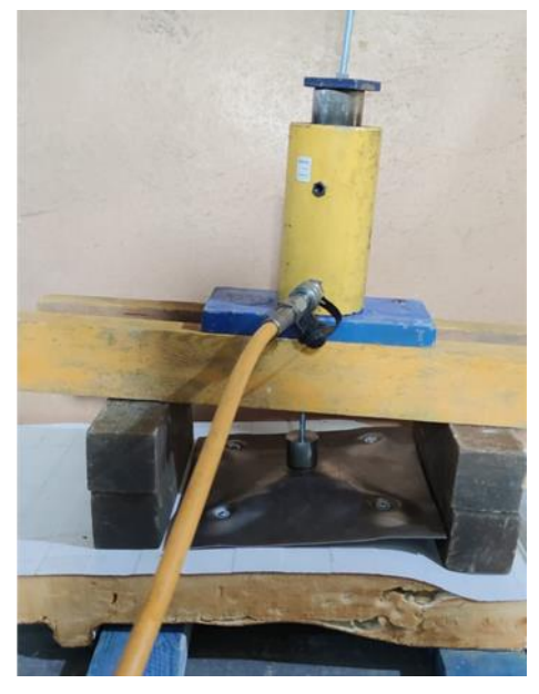
Figure 2b. Picture of NovaFlat specimen failure mode (System 1)

Controlled by Technical Personnel: Kadir Yaşar ULUDAĞ