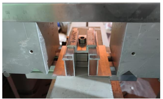
Figure 1a. Picture of NovaClamp specimen tensile test setup